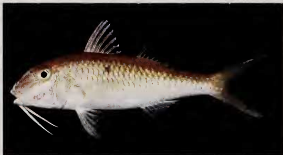
Fig. 1. Parupeneus heptacanthus , BPBM 29732, 130 mm SL, Lombok, Indonesia (Photo by J. E. Randall).

Lengths of specimens are given as standard length (SL), measured from the front of the upper lip to the base of the caudal fin (posterior end of the hypural plate); head length (HL) is measured from the same anterior point to the posterior end of the opercular flap; body depth is taken vertically from the base of first dorsal